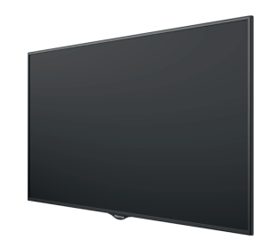
Specification subject to change | June 2022