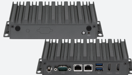
AIEdge-X ® 100