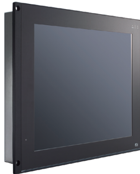
▲ Side view