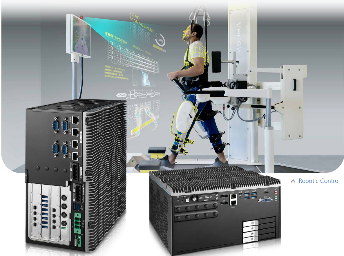
▲ Robotic Control

13th/12th Gen Intel® Core™ i9/i7/i5/i3 Processor (Raptor Lake/Alder Lake) Flexible AI Inference Workstation