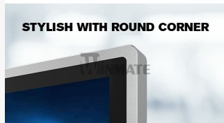
STYLISH WITH ROUND CORNER