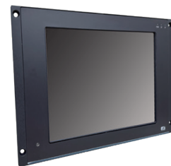
▲ Touch without keypad version