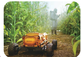
^ Mobile Robots