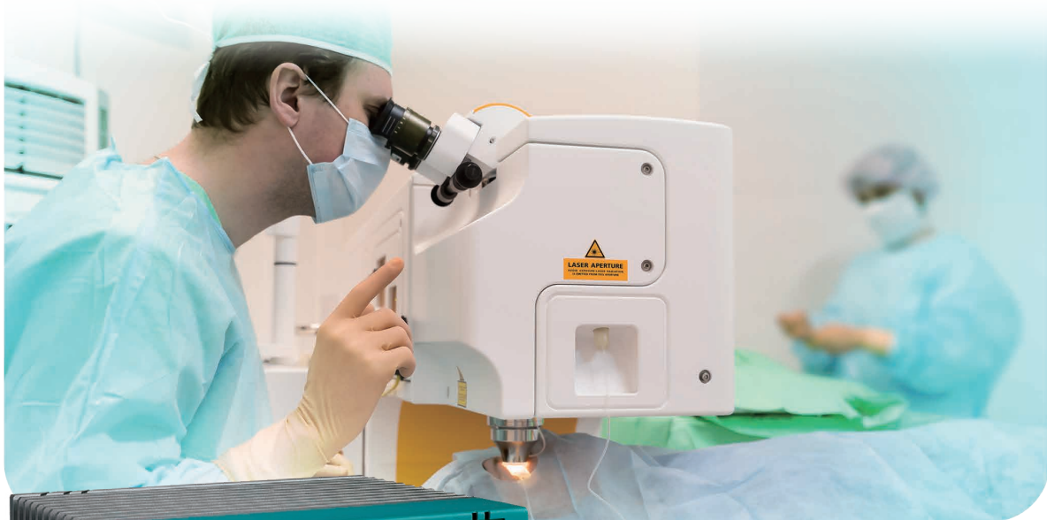
^ Medical Imaging

NVIDIA® Jetson Orin™ NX Embedded AI Computing System