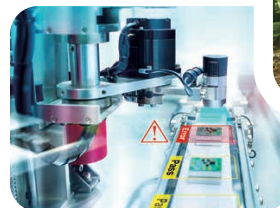
v High-speed AOI