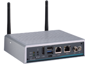
▲ Front view