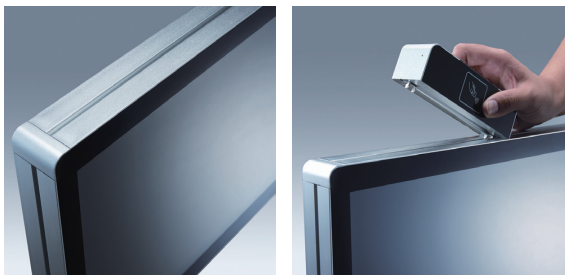
Side groove design for Flexible peripheral device