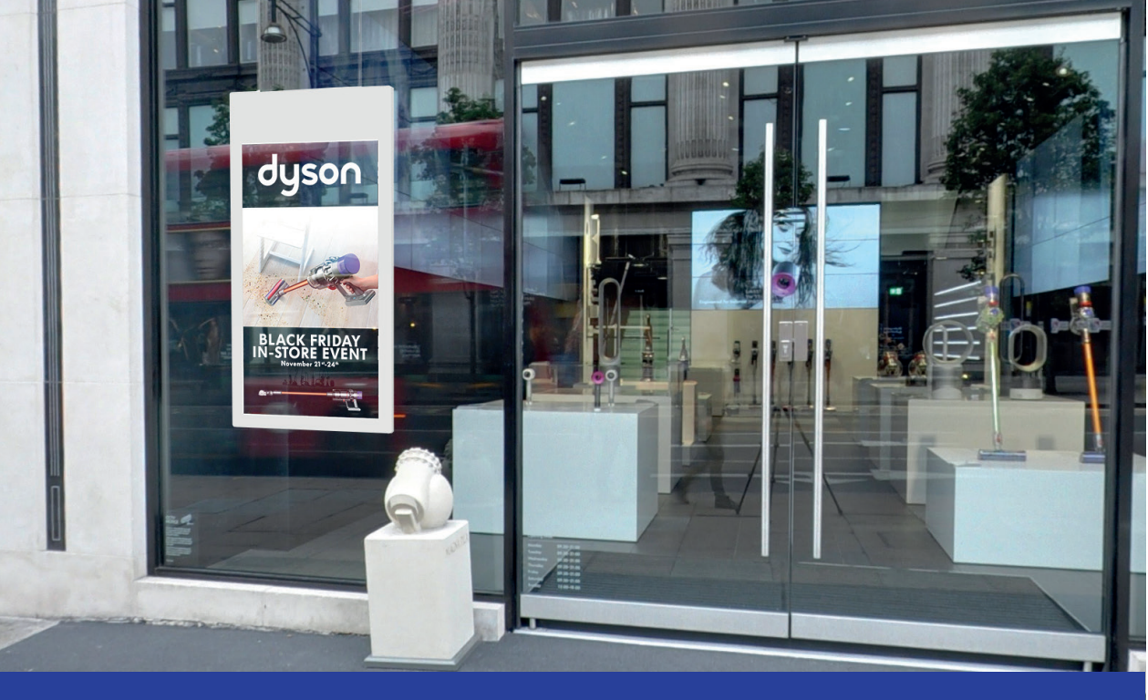
Maximise window displays by broadcasting content inwards and outwards