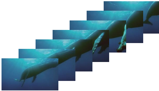
Frame by frame