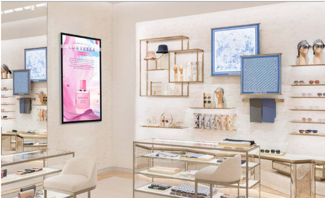
Premium displays that combine stunning tablet-like aesthetics with a robust protective enclosure and tempered glass face