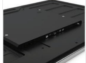
CONNECT EXTERNAL DEVICES