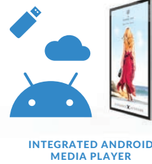
INTEGRATED ANDROID MEDIA PLAYER