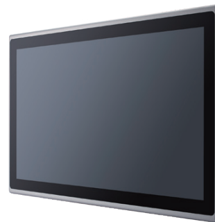
▲ Ultra-slim mechanism design