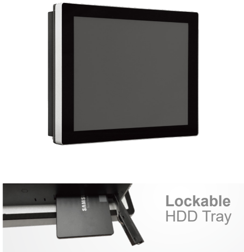
Lockable HDD Tray

15" P-cap Panel PC with Celeron® N3160, IP65 / 66 Bezel-Free and Wide Range Power Input