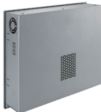
▲ Back view