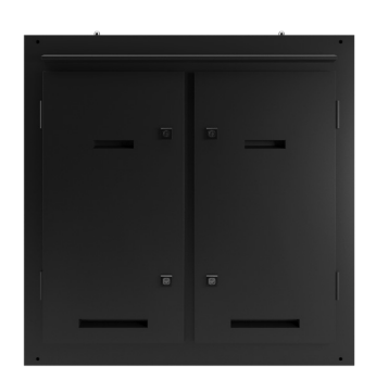
Specification subject to change | January 2022