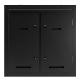
Specification subject to change | January 2022