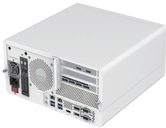
▲ Rear view