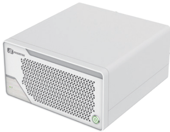
▲ Front view

Medical Grade System with 13th/12th Gen Intel® Core™ i9/i7/i5/i3 Processor for Smart Healthcare Applications