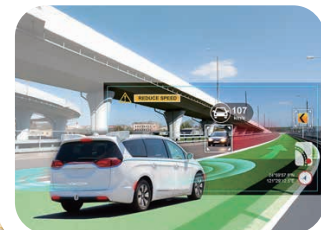
▲ In-Vehicle Computing