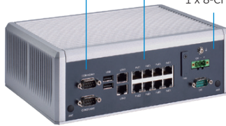
▲ Rear view