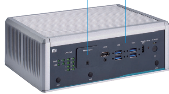
▲ Front view