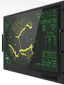
Option 1 With AR Protection Glass, No Touch function