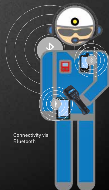
Connectivity via Bluetooth