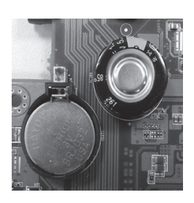
Both battery and wide temperature goldcap onboard