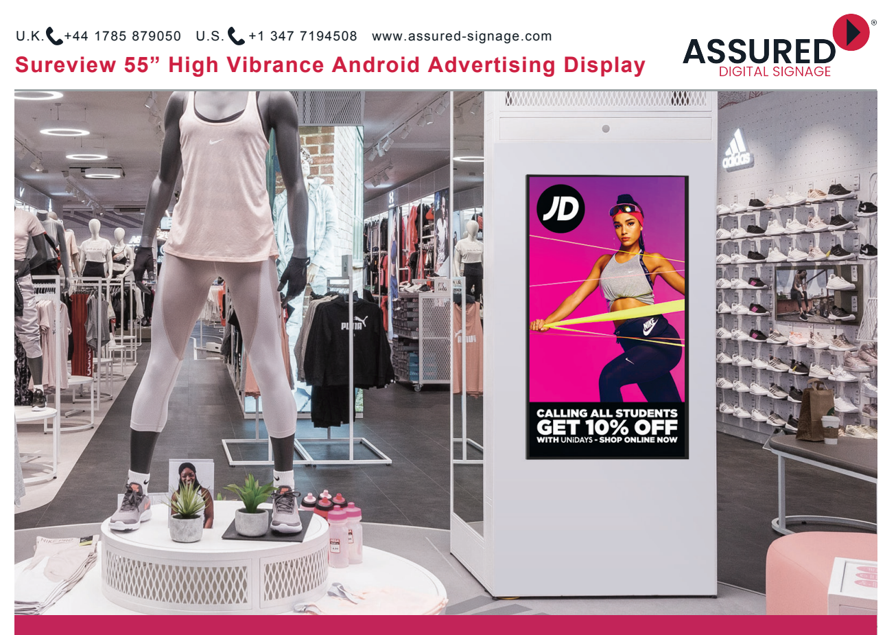
Perfect for brightly-lit retail environments or as a budget friendly window display