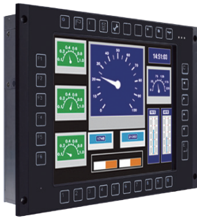
▲ Side view