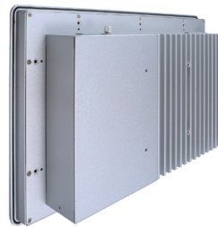
▲ Rear view