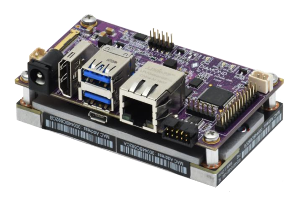
ZiggyBox internal electronics showing Jetson TX2/TX2i Module and Diamond Ziggy carrier board