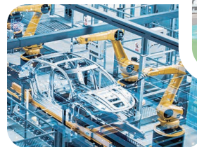
▼ Real-time AOI