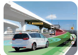
▲ In-Vehicle Computing