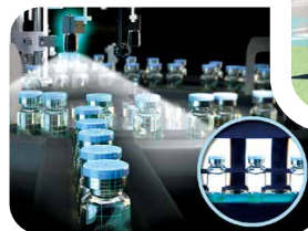
▼ Smart Manufacturing