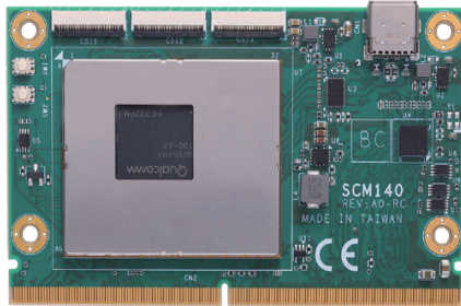
▲ Top view

RISC Embedded SMARC v2.1 SoM with Qualcomm QCS6490 Octa-core Processor, up to 2.7GHz