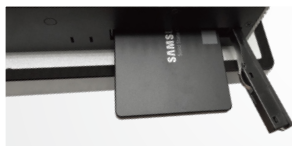
Lockable HDD Tray