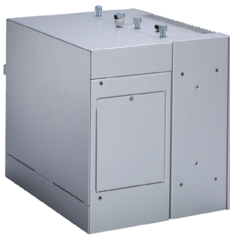
▲ Rear view