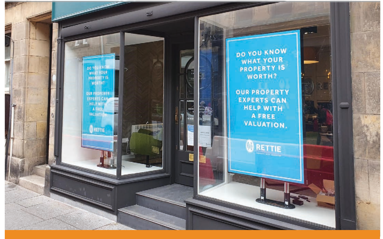
Designed for outward-facing window displays in direct sunlight