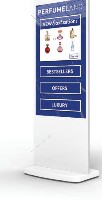
24/7 COMMERCIAL USE