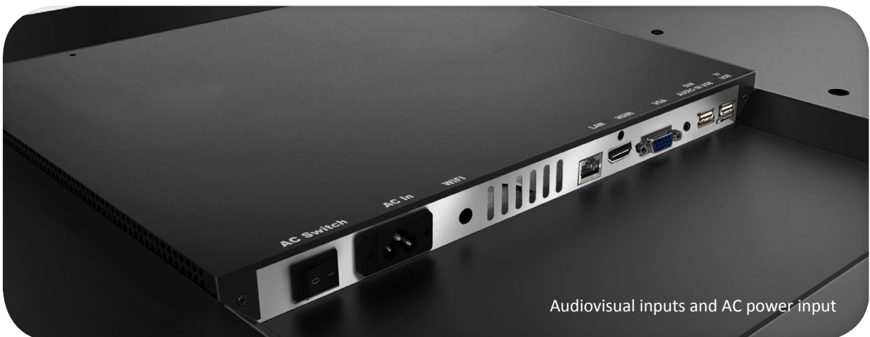
Audiovisual inputs and AC power input