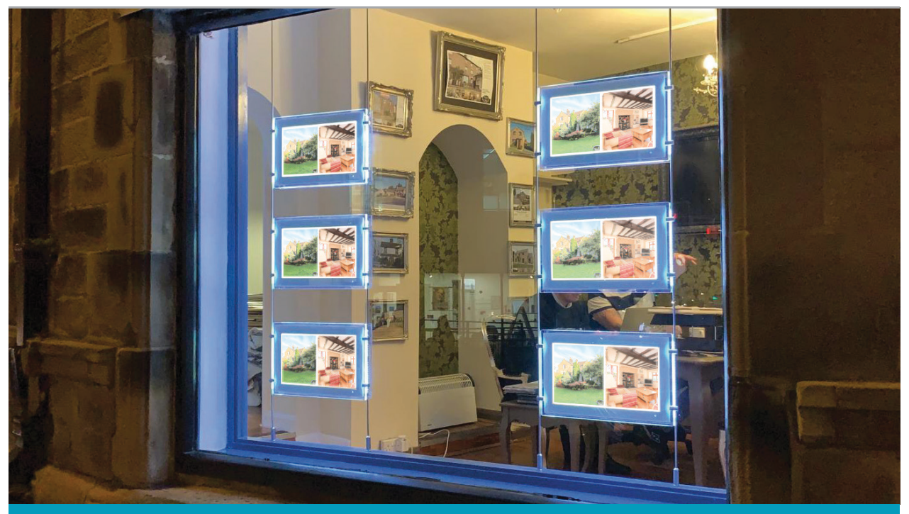
Bring estate agent windows to life with the state-of-the-art digital signage technology that replace traditional light pockets