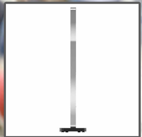
46" Slimline Freestanding Digital Poster