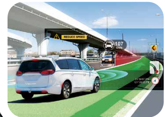
▲ In-vehicle Computing