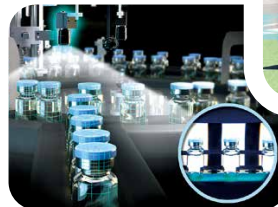
▼ Smart Manufacturing