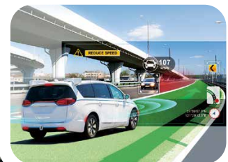
▲ In-vehicle Computing