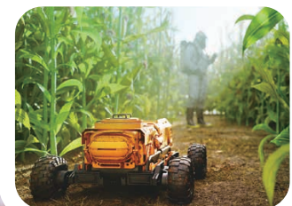
^ Mobile Robots