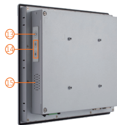
▲ Rear view