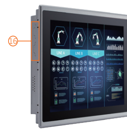
▲ Side view