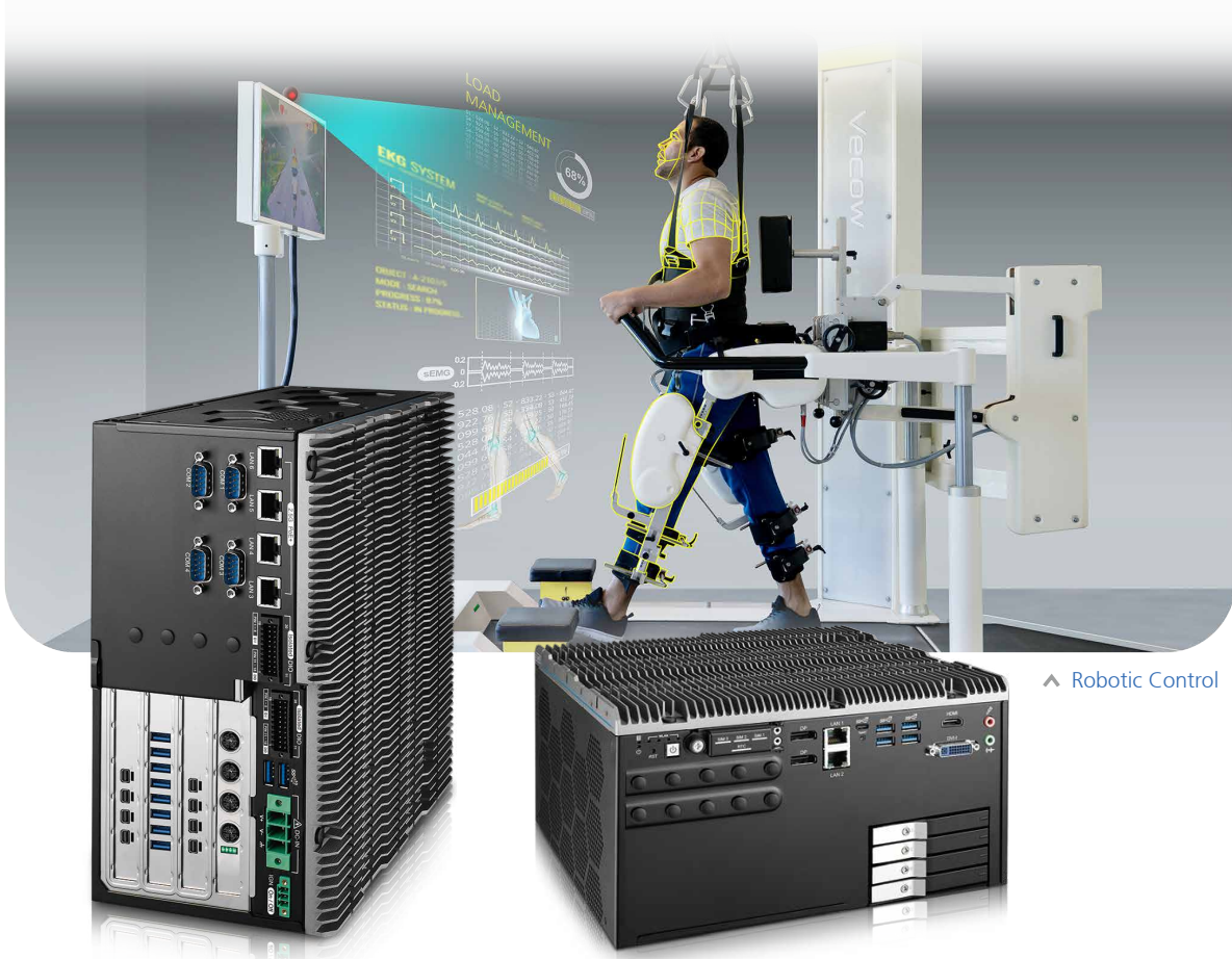
▲ Robotic Control

13th/12th Gen Intel® Core™ i9/i7/i5/i3 Processor (Raptor Lake/Alder Lake) Flexible AI Inference Workstation