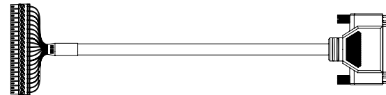
Figure 2: 8B Backpanel Interface Cable