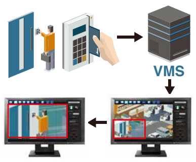
Example: Automatic screen layout adjustment in response to key card usage.

The monitor's web API supports customizable integration with the local video management system (VMS). This allows operators to assign a specific response from the monitor to automatically occur based on a preset time schedule or when a particular event takes place.