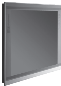
▲ Ultra-slim mechanism design