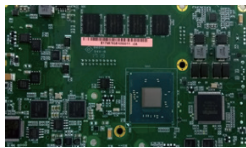
Onboard processor and system memory for great reliability and stability