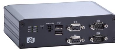
▲ Front view