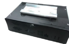
DIN-rail, wall mount supported for various applications, without space limitation