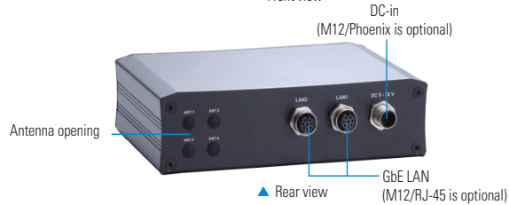
▲ Rear view