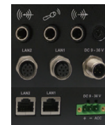
Optional I/O ports for audio, LAN jack type and DC-in jack type