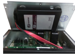
Easy storage maintenance