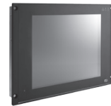
▲ Touch without keypad version