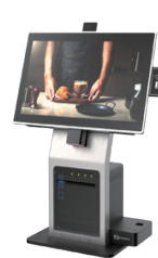
▲ Countertop stand (landscape)