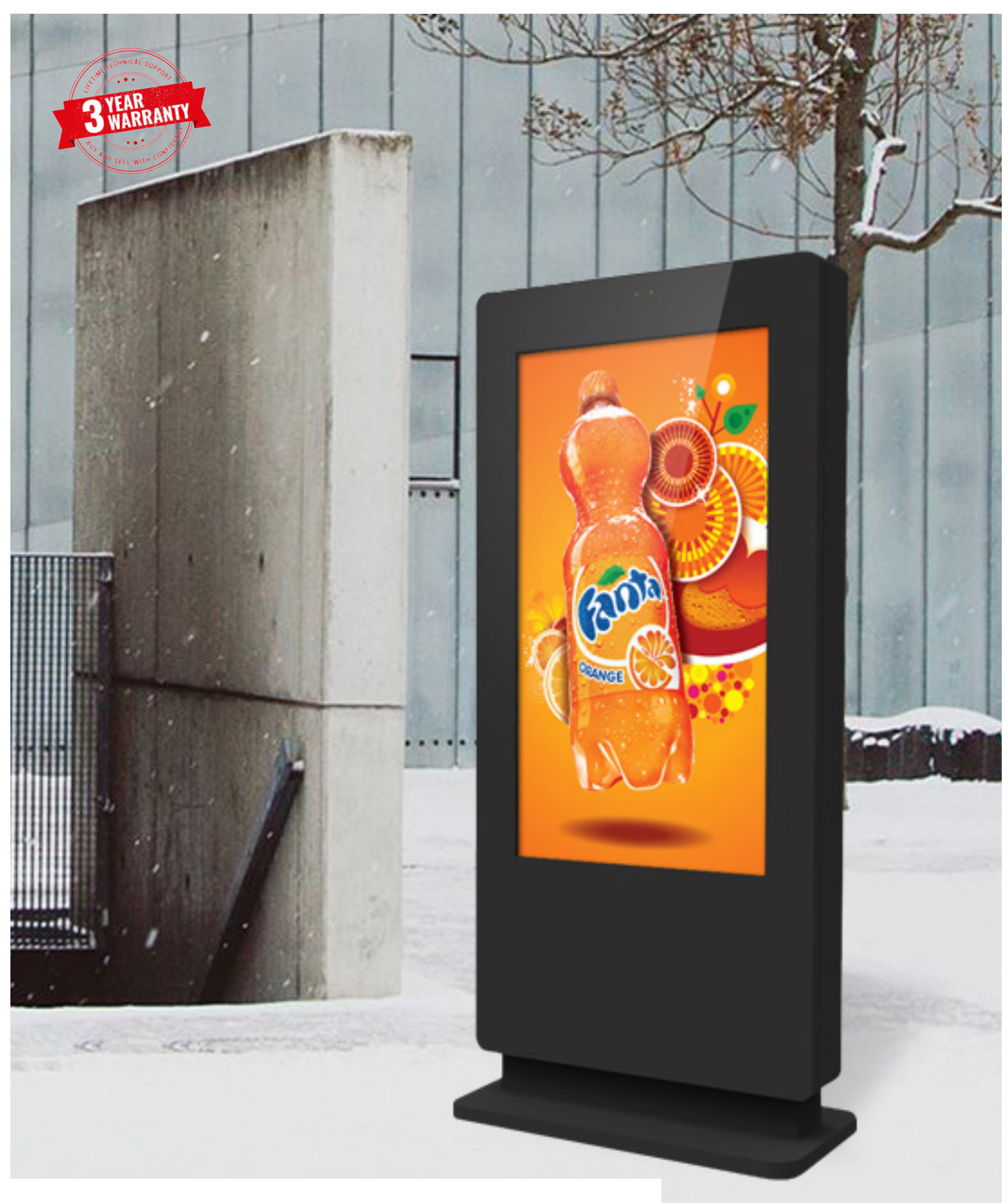
49" Outdoor Freestanding Digital Posters