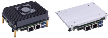
▲ Assembly view